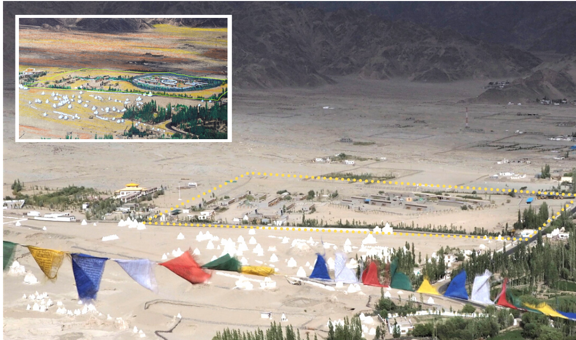
Photograph and sketch by Tom Turner showing the Druk Padma Karpo School campus with the sacred white stupas in the foreground and the barren desert landscape behind

The school campus is already an oasis of education, a place to work, study, play, explore and live. A place for young people to discover their talents and to develop as individuals.