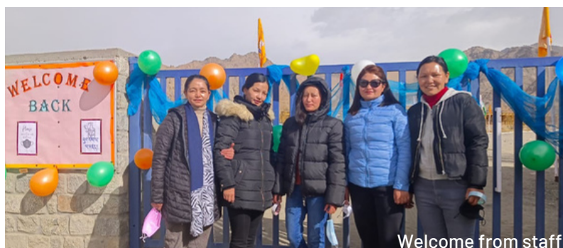
Welcome from staff