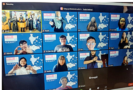
Virtual meeting on Zoom sharing cultural traditions

The first virtual cultural exchange between students of the Druk Padma Karpo School and Ngee Ann Polytechnic, Singapore from Sept. 7th -15th 2021 was a new experience for our students and highly successful. The programme was full of learning, sharing thoughts and swapping ideas. Our students enjoyed the programme and absorbed new ideas about culture, time management, punctuality, cleanliness, calmness, politeness and more.