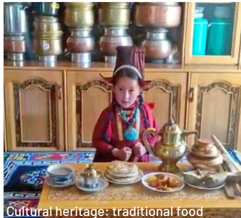
Cultural heritage: traditional food