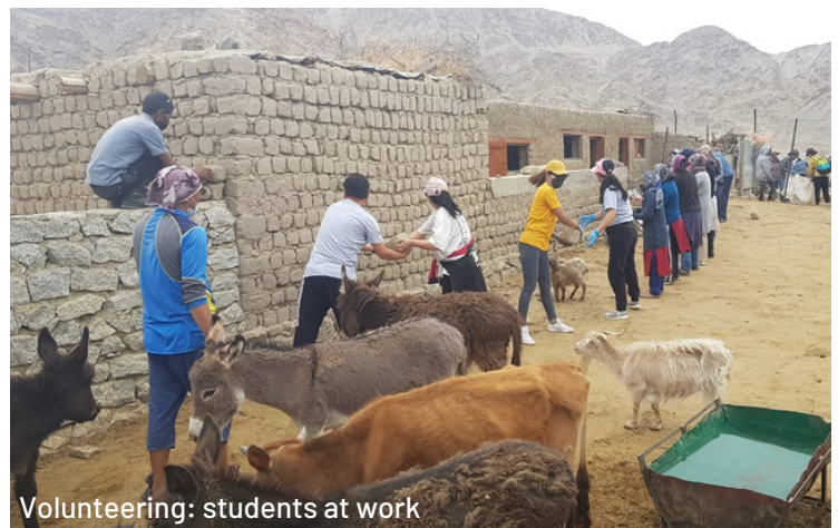
Volunteering: students at work

After a successful day, students expressed the desire to continue such volunteer work in the future.