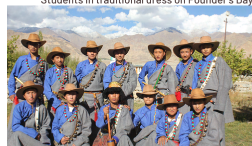
Students in traditional dress on Founder's Day