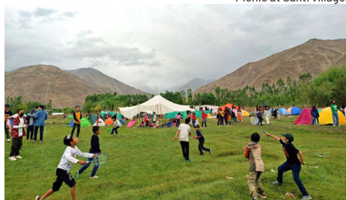
Picnic at Sakti village