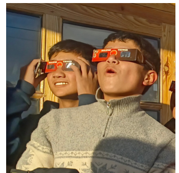
Viewing solar eclipse