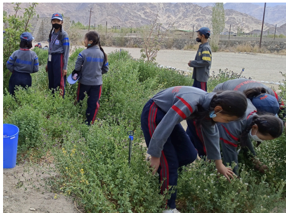
The ecology club was launched this year with a mission to cultivate environmental awareness among students