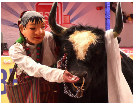
The audience at the Founder's Day ceremony in September was entertained by students' performances of dance, drama and song