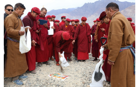
The foundation stone for the second DPKS branch school was unveiled in October

The wishes of parents in the remote district of Nubra Valley will soon be fulfilled with the opening of a DPKS branch school at Nubra Skampuk in November 2026. Starting with nursery and kindergarten classes, the school will expand year by year up to matriculation level. Although the school is only 145 km from the mother school in Shey, the journey crosses Khardung-La, one of the world's highest mountain passes at an elevation of about 5,500 metres (18,000 feet). The laying of the foundation stone by His Eminence Thuksey Rinpoche on October 29 th , 2024 was celebrated with prayers, an inauguration ceremony and performances of dance and songs by students and villagers. Thanks were given to the villagers who donated the land as well as those involved in the planning. The first branch school at Khachey, in the remote Phokar Valley, opened in April, 2010.