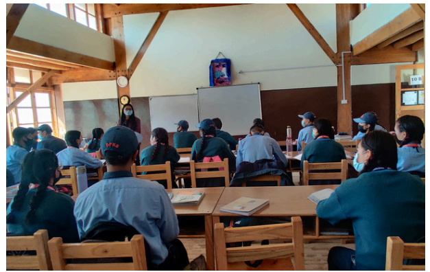
Classroom architecture used to teach students about geometry

"Thanks to the brilliance of our architects and engineers, our building becomes a daily lesson in geometry, sequences and patterns showing students that maths is not just in textbooks, it is all around us."