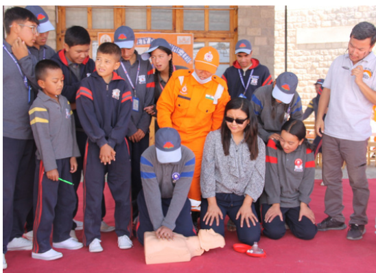
Students and staff attended a safety awareness workshop which also covered basic first aid

At this time of climate change, it is important for everyone at the school to have a better understanding of how to stay safe and respond effectively to emergencies.