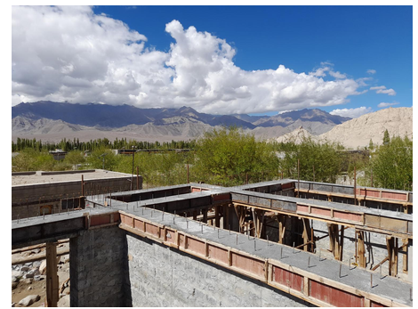
The new health centre will provide the school with isolation wards and a consultation space

The construction season began its winter break at the end of October and re-opened on April 1 st 2025. The seismic upgrade of other classrooms resumed and construction of the two buildings started last year also continued. It is hoped that funding will be in place for work to start on another set of new classrooms towards the end of 2025.